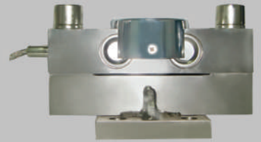
Load cells MK-QS-D